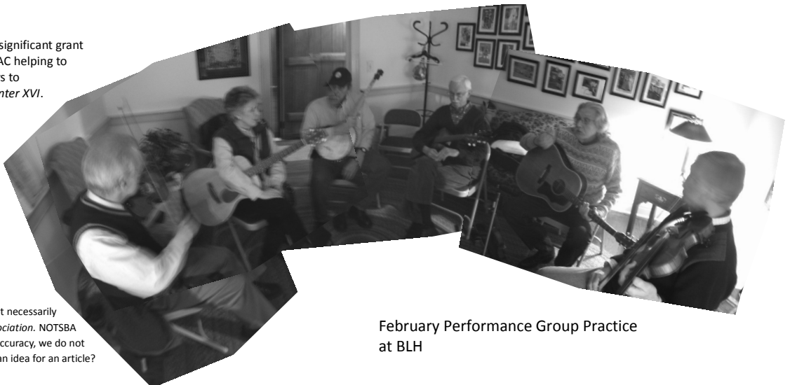
February Performance Group Practice at BLH